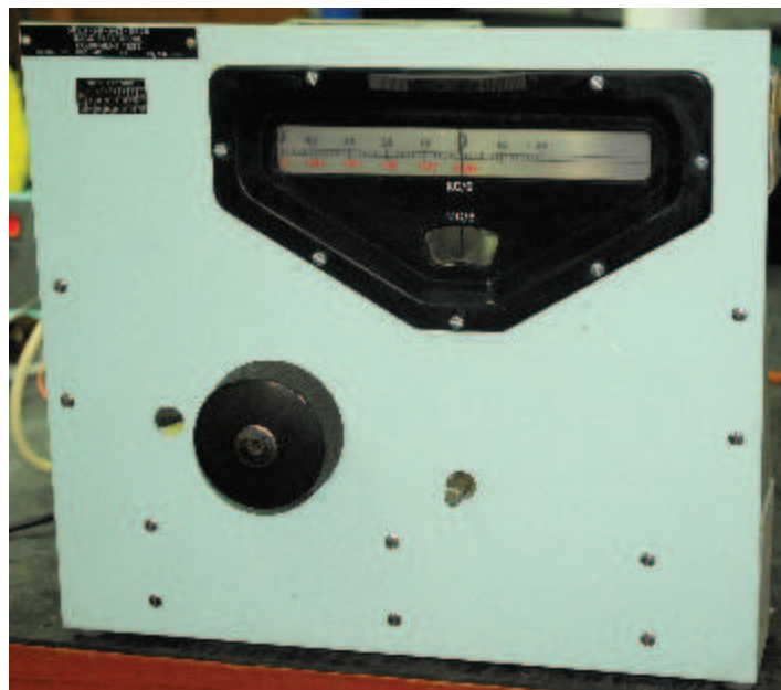
Left: I recently acquired a genuine RACAL VFO2 Test Set.

Below: The underside of VFO2 seen through the bottom of the test set. Like the PSU, this sub-assembly had likely been refurbished back in the 1970s judging by the style of capacitors used. However, all tubular capacitors and carbon resistors have now been replaced with modern components.